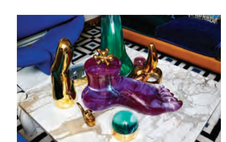
Adler first makes decorative objects in clay, then has them produced in materials including Lucite and brass.