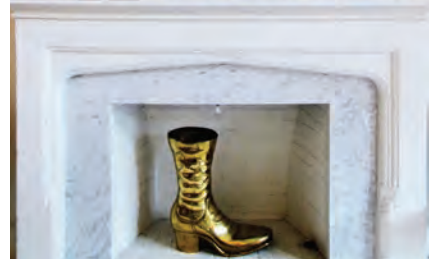
Found treasures include these Italian glass heads and a vintage boot discovered in South Beach.